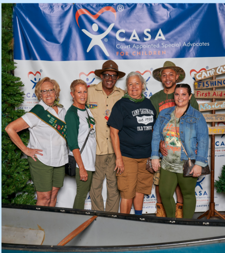
Attendees at our 2023 Heroes Gala and Benefit Auction, "Camp CASA"