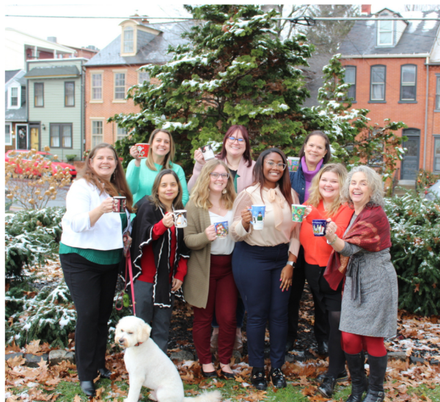
CASA Staff 2023 Holiday Card Photo