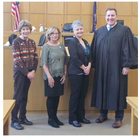
Fall 2023 Lebanon Training Class at their Swearing In Ceremony

Volunteer services are valued at $233,335 ...translating into savings for our community.