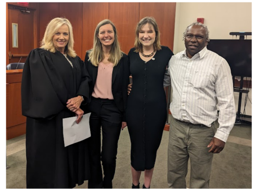
Fall 2023 Lancaster Training Class at their Swearing In Ceremony

"The family made great strides in therapy, enabling them to be more accepting of the youth's gender identification and working out past issues. The youth reached a point where they were requesting to go home. I feel I was most instrumental in advocating for more therapy, both individual and family to address the numerous issues that this youth faced. I also feel I was instrumental in ensuring the youth's wishes and identity choices were conveyed to the team and respected.