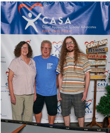
Attendees at our 2023 Heroes Gala and Benefit Auction, "Camp CASA"