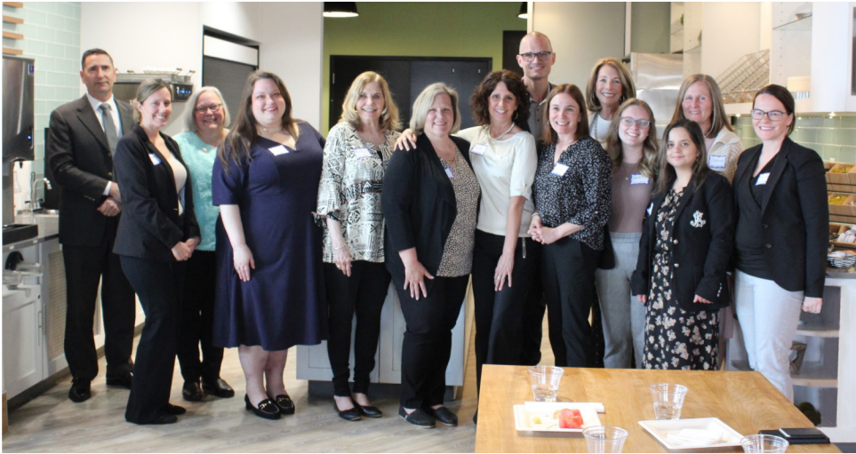
Spring 2023 Lancaster Training Class at their Swearing In Ceremony