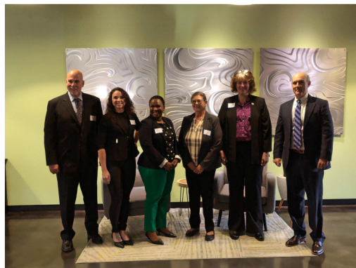
Summer 2023 Lancaster Training Class at their Swearing In Ceremony